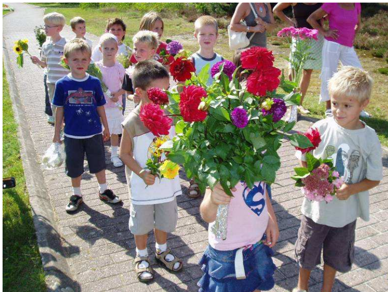
Some of the younger children at Boxbergheide wait for their turn to place their flowers.

The good news is that the committee for the Limberg Provincial RAF Memorial has been reformed with enthusiastic young members determined to maintain this colourful annual memorial ceremony for many years to come.